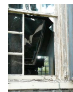
View of the broken window, July 25, 2010

The resulting expenses stretched but did not break the Concord budget. We will be considering planning and fundraising for a more permanent (and historically suitable) repair to the bulkhead basement doors.