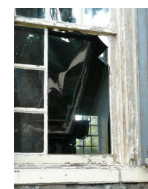
View of the broken window, July 25, 2010

The resulting expenses stretched but did not break the Concord budget. We will be considering planning and fundraising for a more permanent (and historically suitable) repair to the bulkhead basement doors.