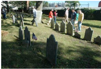
Battle of Germantown Day October 2, 2010