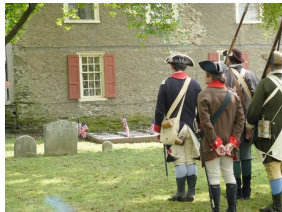
Battle Day 2009